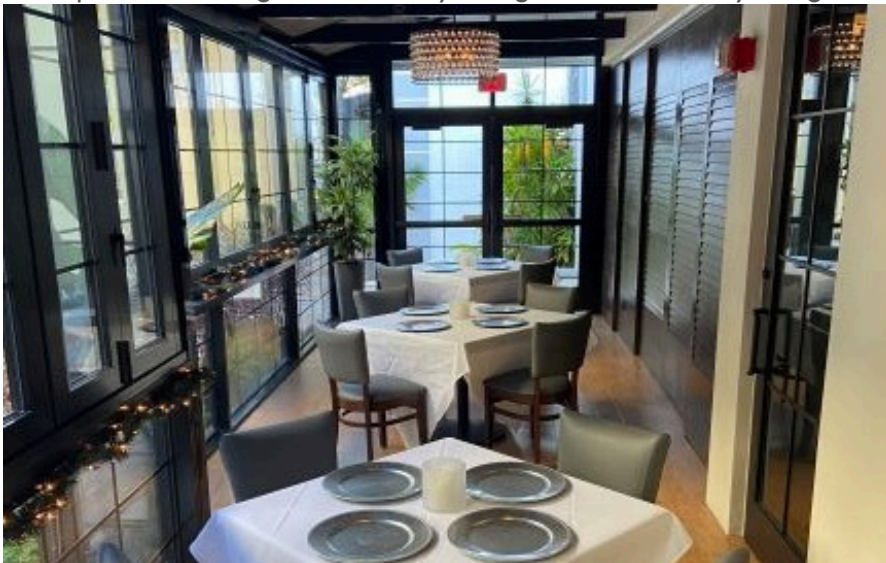
The Terrace 12' x 45'

For a more expansive and versatile option, the Naples Room & Terrace combine to create a semi-private group dining area, perfect for larger events. The floor-to-ceiling windows seamlessly the two spaces offering a beautifully integrated area for your gathering.