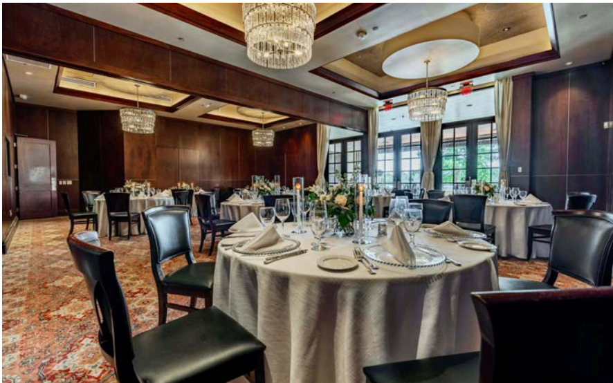
The Stone Crab Room 37' 9" x 29' 10"

72 Seated with Full Rounds 48 Seated with Crescent Rounds 28 Seated Boardroom Style 100 Cocktail Style Reception