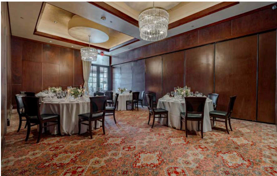
The Capri Room 18' 3" x 28' x 10"

40 Seated with Full Rounds 24 Seated with Crescent Rounds 18 Seated Boardroom Style 50 Cocktail Style Reception