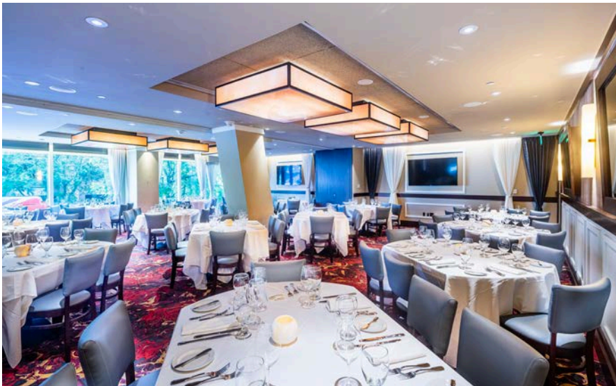
The Ocean Room 32' 4" x 38' 10"