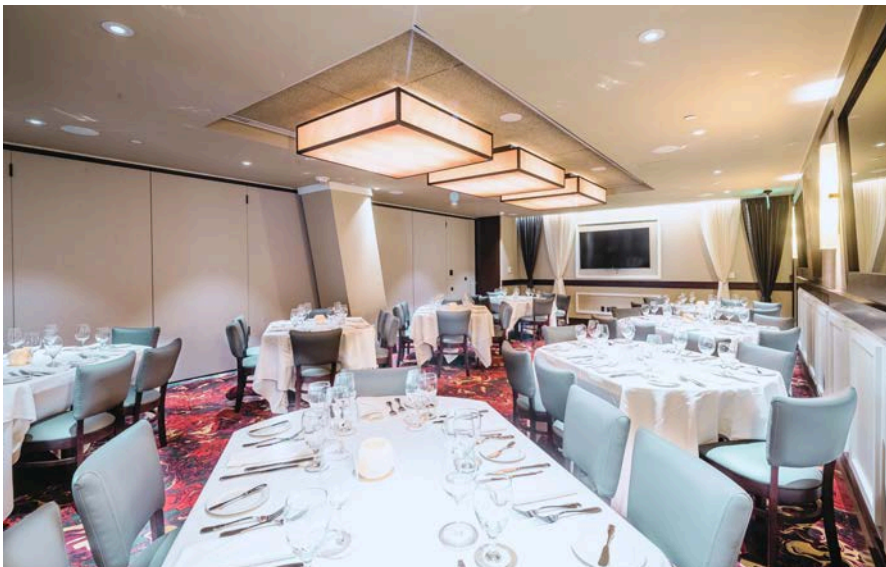
The Marina Room 32' 4" x 19' 5"