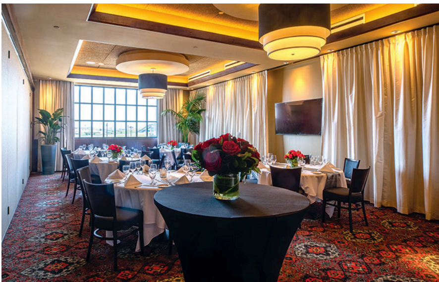
The Naples Room 35' 4" x 20'