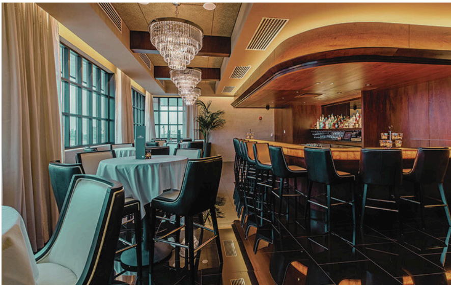
The Rose Lounge 22' 8" x 20' 1"

The perfect setting for a pre-function cocktail or registration area offering an inviting ambiance to complement your event in the Stone Crab Room.