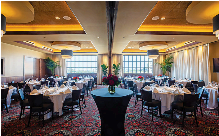
The Stone Crab Room 40' 2" x 35' 4"

The Stone Crab Room offers exceptional versatility with a soundproof airwall, effortlessly transforming into two private spaces: the Naples Room and the Pearl Room.