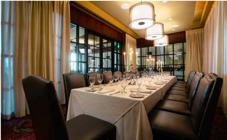
The Big Deal Room 13' x 25'

This exclusive private room, conveniently situated on the main floor near the main dining area, boasts elegant glass doors adorned with curtains that can be drawn to ensure total privacy.