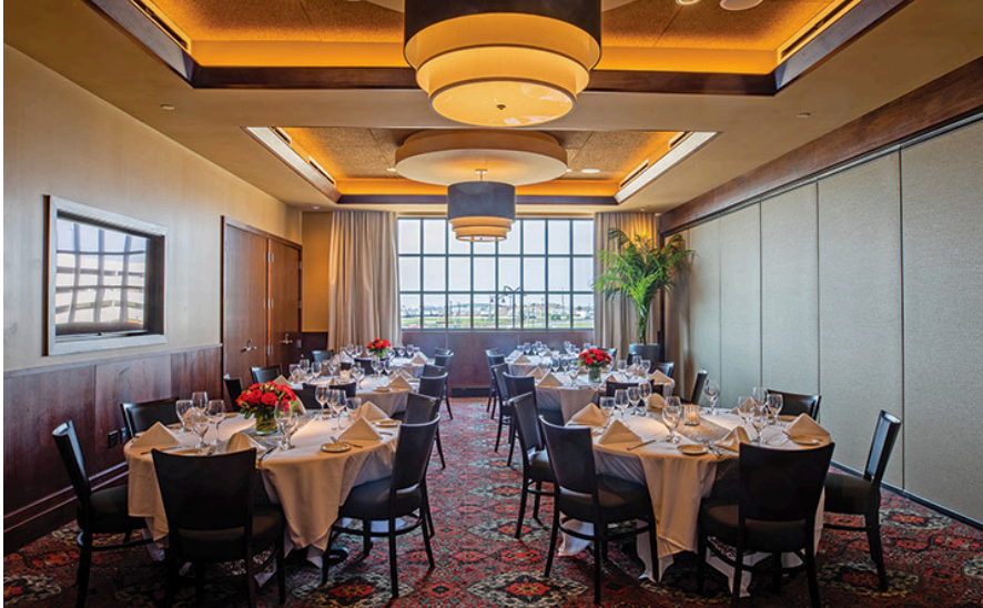
The Pearl Room 35' 4" x 20'