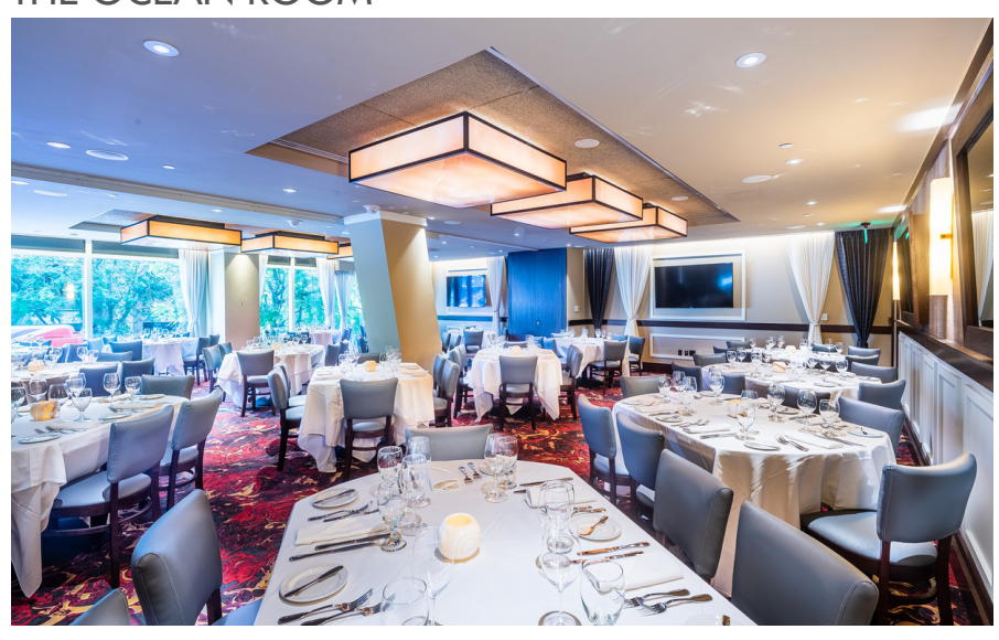
The Ocean Room 32' 4" x 38' 10"